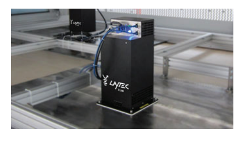
Fig. 1: In-line version of X Link: the measurement heads can be integrated into the cooling press of the laminator or further down the production line.

Recent tests performed with a major industrial customer demonstrated that LayTec's X Link metrology system (Fig. 1) can be applied for evaluation of the cross-linking degree of polyolefins, too. Fig. 2 shows metrology data obtained from 4 solar modules that had been laminated for the period of 18, 21, 24 and 27 minutes (plotted on the x-axis). X Link measured the mechanical properties of the polyolefin and derived values of the "LayTec cross-linking metric" (LXM) that are plotted on the y-axis. The LXM clearly correlates with the lamination duration, thus proving to be a suitable measure for gauging lamination quality of solar modules with polyolefin encapsulation.