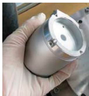
Fig. 1: AbsoluT's head with reference light emitter

All reactor-to-reactor and ring-to-ring temperature variations caused by manufacturing tolerances of the equipment (viewport and window variations) can now be easily corrected. The new method will replace the less accurate and more time consuming method of eutectic calibration used currently.