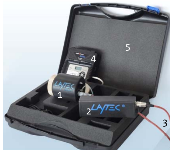
Fig. 2: Delivery content: 1 - handheld device with the reference light emitter, 2 - rechargeable battery pack, 3 - temperature resistant cables, 4 - battery charger, 5 - tool case

A calibration with AbsoluT takes only 30 minutes per reactor and profoundly shortens maintenance cycles. The user just has to transfer the AbsoluT head into the chamber and position it with its heat resistant surface against the reactor lid under the optical view-port ( Fig. 1 ). The calibration data is automatically tracked and processed in order to provide an updated configuration file. Recently, the new method was successfully approved at industrial customer sites.