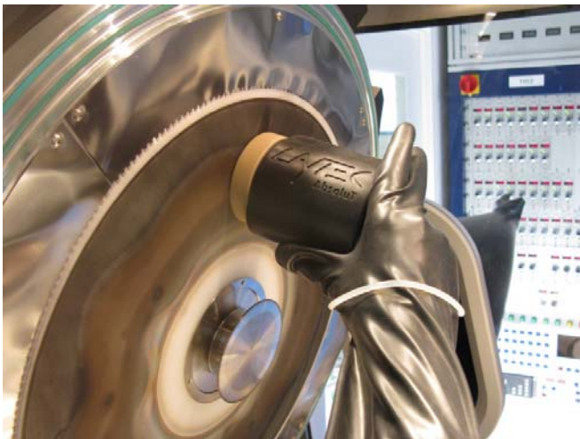
Fig. 1: AbsoluT in operation: the operator positions the reference light emitter with its emitting area (PEEK contact surface) against the lid where the temperature view port is located

AbsoluT helps to correct all reactor-to-reactor and ring-to-ring temperature variations caused by adjustment, window coating or manufacturing tolerances of the equipment, such as viewport diameters. The new method replaces the less accurate and more time consuming method of eutectic calibration that has been applied until now.